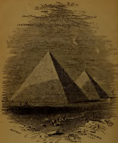
Pyramids of Ghizeh.

idea of the immense labour that must have been expended on their construction.